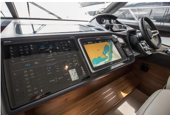
Lower Helm Consol