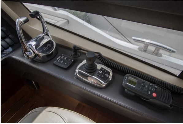
Throttles lower Helm