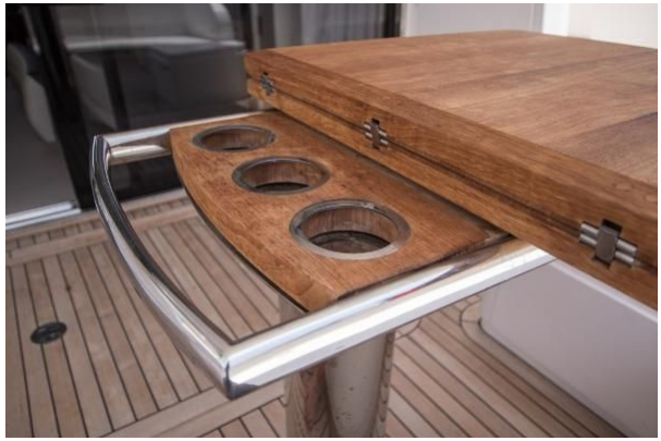
Cockpit teak table