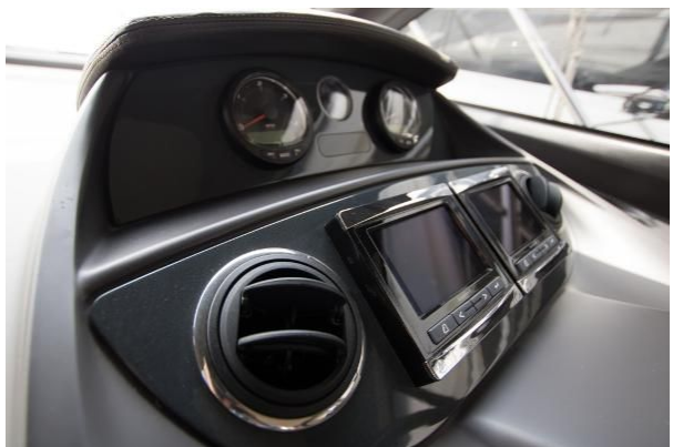
Lower helm consol