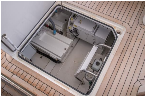
engine room hatch