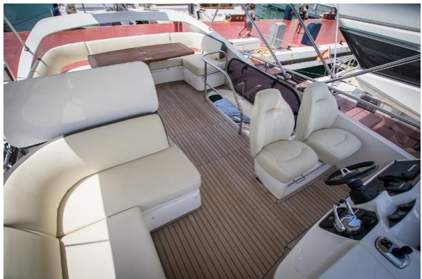
Flybridge seating area