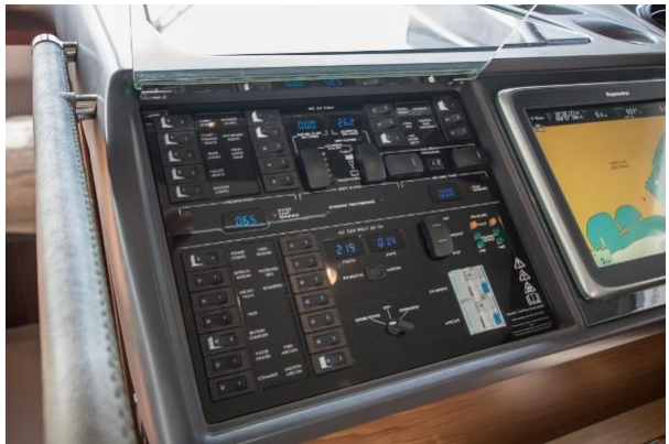
Lower helm consol