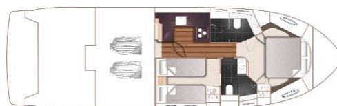
Princess 43 Lower Deck Layout Plan