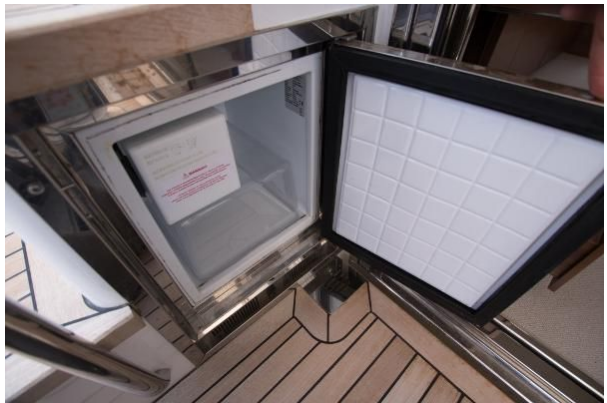
cockpit ice maker