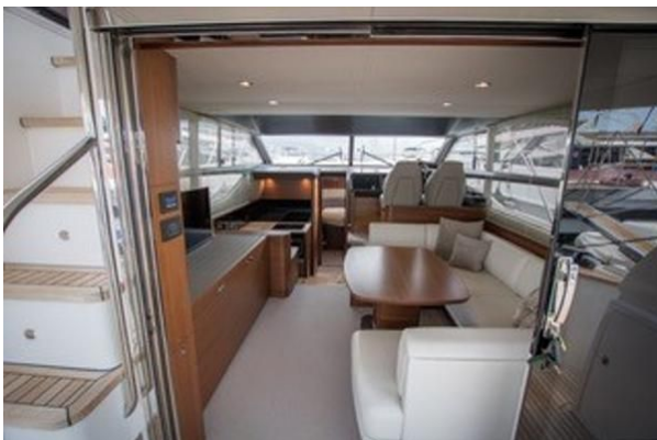
Saloon from Cockpit