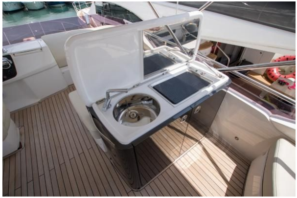
BBQ and sink on flybridge