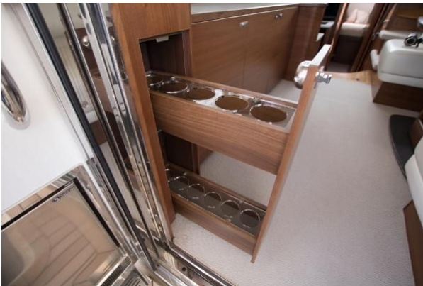
Bottle cupboard in saloon